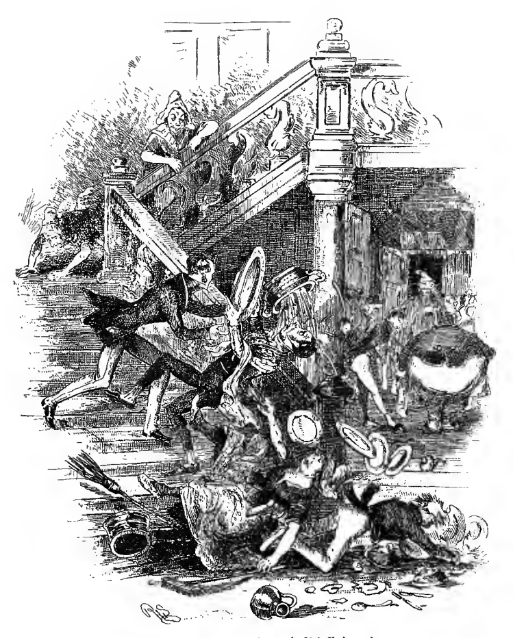
Arrival of the "Chargé d'Affaires."